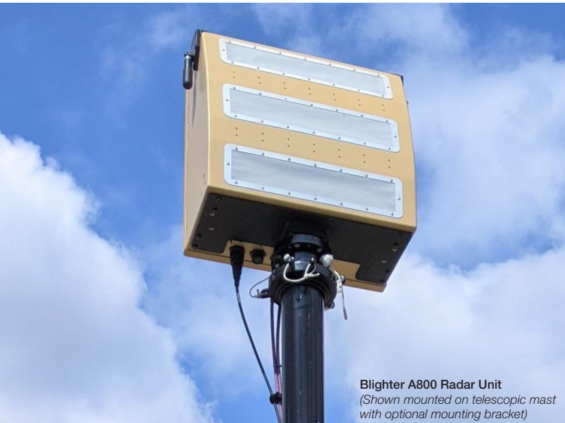
Blighter A800 Radar Unit (Shown mounted on telescopic mast with optional mounting bracket)