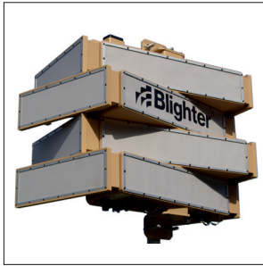
Bligher B303 Radar (180° azimuth scan angle)