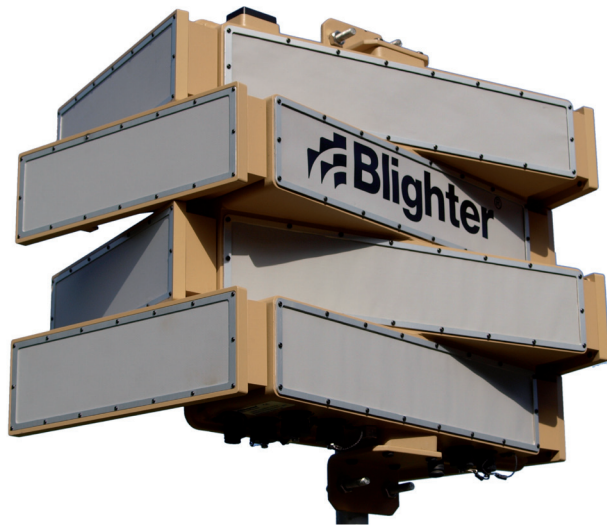
Blighter B303 Radar (180° azimuth scan angle)