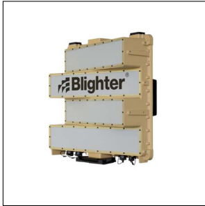
Blighter B202 Mk 2 Radar (80° or 90° azimuth scan angle)