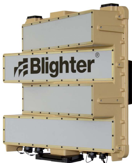
Blighter B202 Mk 2 Radar (80° or 90° azimuth scan angle)