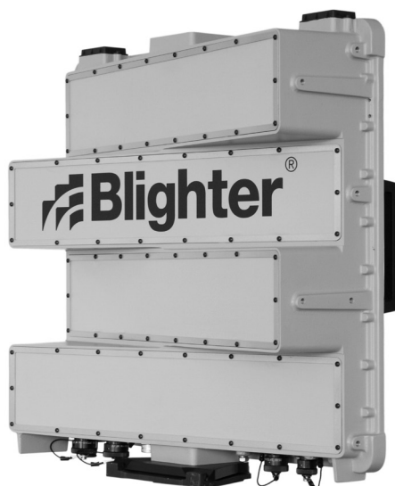
Blighter B202 Mk 2 Radar (80° or 90° azimuth scan angle)