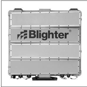
Blighter B202 Mk 2 Radar (80° or 90° azimuth scan angle)